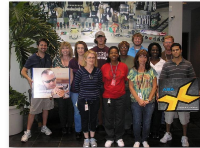
Blue Team - Safariland

We recently held a Kaizen Facilitator Report Out Event during which two teams of now certified Kaizen Facilitators presented their results. The Blue and the Green team both celebrated their successes. Since the Safariland Team's (Blue's) results were so significant, we want to share their value savings.